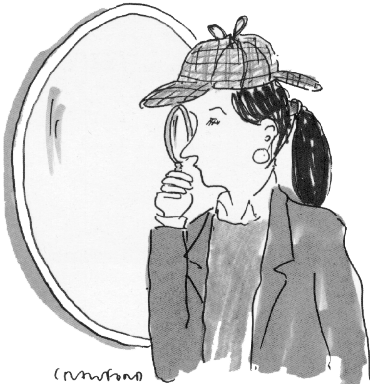
The professional who reasons productively casts a critical eye on her own role in a company's problem.

First, the consultants would have demonstrated their commitment to continuous improvement by being willing to examine their own role in the difficulties that arose during the consulting project. No doubt they would have identified their managers and the clients as part of the problem, but they would have gone on to admit that they had contributed to it as well. More important, they would have agreed with the manager that as they explored the various roles of clients, managers, and professionals, they would make sure to test any evaluations or attributions they might make against the data. Each individual