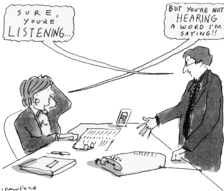
It's not enough to talk candidly. Professionals can still find themselves talking past each other.

Manager: "I agree. But professionals should take the initiative to educate the manager about the problems they are experiencing."